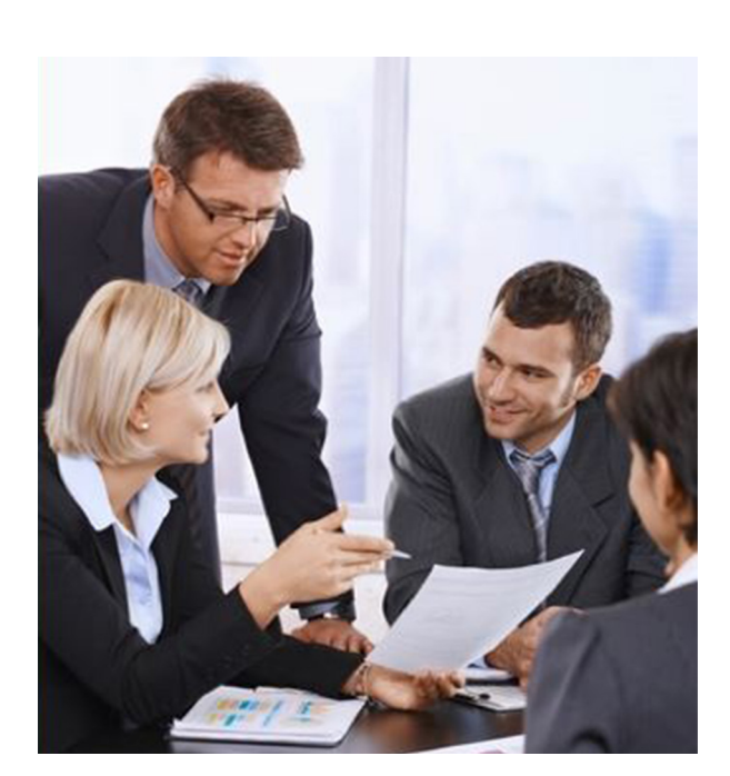
" Grab Your Future"

Technical and Business English offers a variety of business and professional English courses to help students reach their future career goals. Students will learn business professional communication skills and writing, banking, financing, real estate, and legal terminology. Various aspects of business English will be covered, including, but not limited to measurements, social language, participation in meetings, and presentations. Students will also learn how to analyze and produce typical office documents, such as letters, memoranda, presentations, proposals, and reports.